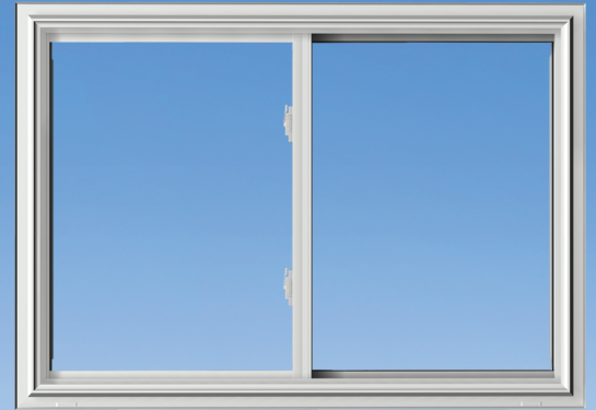
two light slider