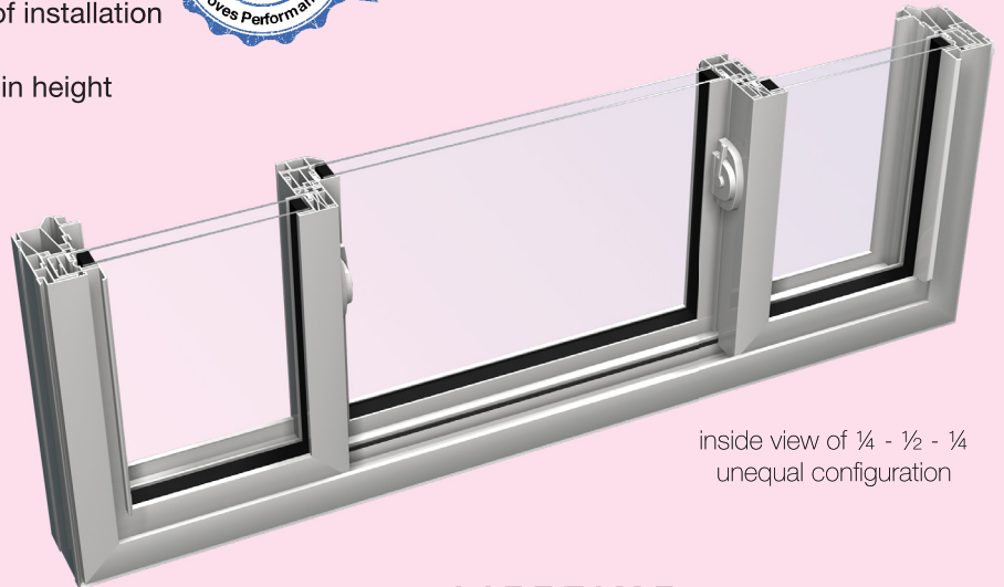
inside view of 1/4 - 1/2 - 1/4 unequal configuration